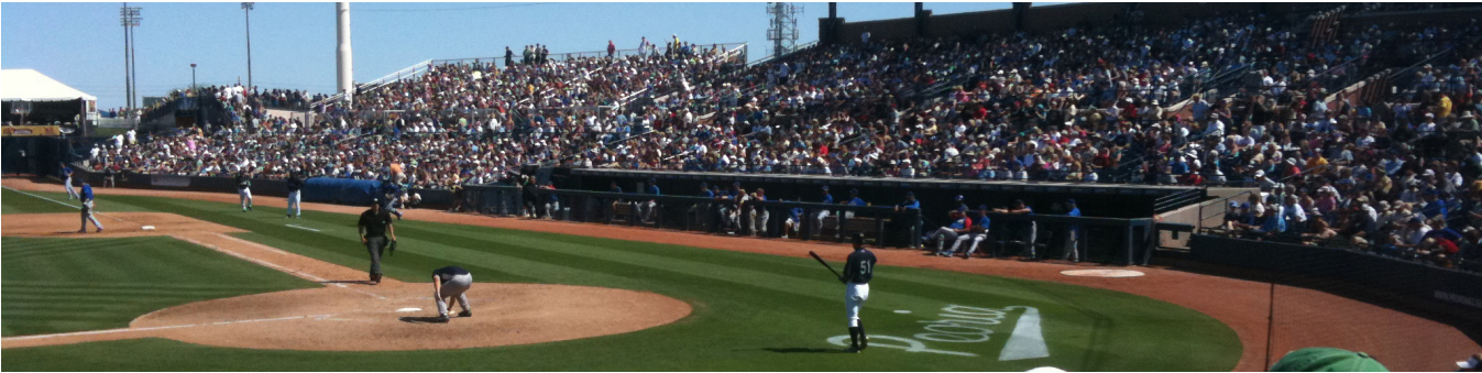
Figure 1: This is a teaser

Julius P. Kumquat The Kumquat Consortium jpkumquat@consortium.net