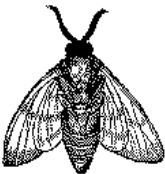
Figure 3: A sample black and white graphic that has been resized with the includegraphics command.

It is strongly recommended to use the package booktabs [15] and follow its main principles of typography with respect to tables: